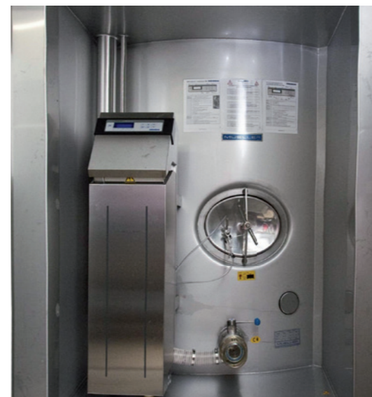
Alcove Stainless steel alcove with built-in MIII cooling and cleaning control system