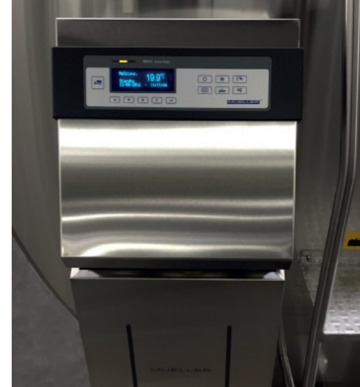
MIII Control Unit Large display showing milk temperature, date, time and system information in several languages